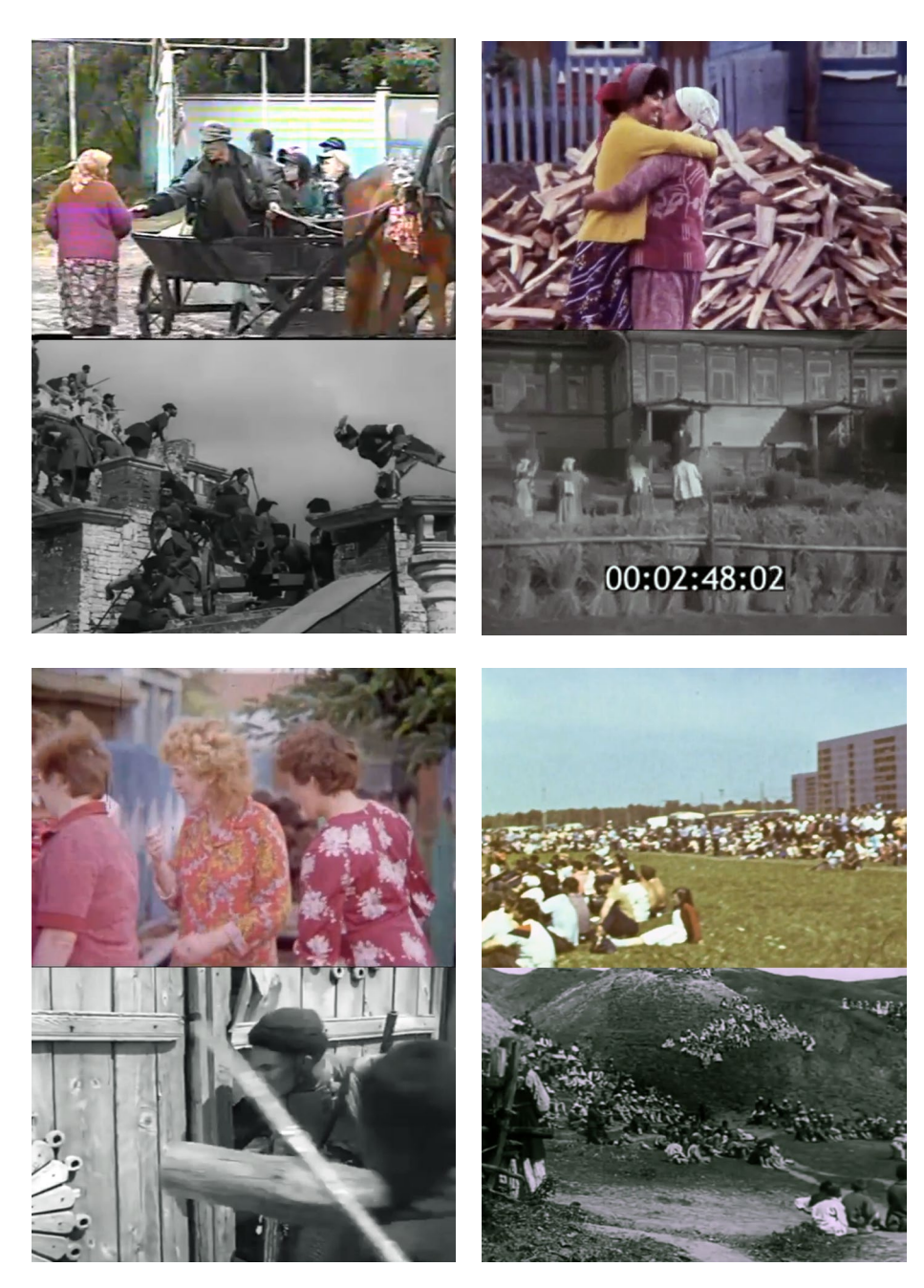
Yaniya Mikhalina, In the Volga-Ural Sky, 2023, film stills