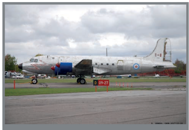
Rarity: The Canadair North Star was a 1940s-50s Canadian development of the Douglas DC-4 designed for Trans-Canada Air Lines (TCA) and the Royal Canada Air Force (RCAF). An RCAF aircraft (serial no 17515), the sole surviving airframe of its type in existence, is currently undergoing a museum-run volunteer conservation project in Ottawa, Ontario, at the Canada Aviation and Space Museum - one of the museum members of Ingenium Canada.