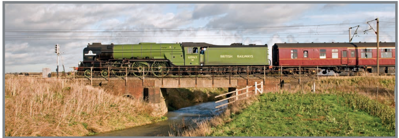
The A1 Tornado is a new-built steam locomotive, completed in 2008 and owned by the A1 Steam Locomotive trust. It is considered to be the 50th Peppercorn A1, numbered next in the class after 60162, Saint Johnstoun, built in 1949. None of the 49 A1 Class locomotives produced in 1948-49, has survived and Tornado fills a gap in the classes of restored steam locomotives that used to operate on the East Coast Main Line. Tornado incorporates a number of safety improvements appropriate to operating on a modern rail network but otherwise is built to the original 1948 drawings and reproduces the renowned performance of the type whilst maintaining the sight, sound and smell of an original locomotive.

Replication can offer a satisfactory alternative when the risks associated with the use of a historic object outweigh the potential benefits. This can be the case in aircraft preservation where airworthy aircraft are in some cases complete replicas. This does not detract from the sensory and emotive experience that the casual observer can gain from the operation of the object.