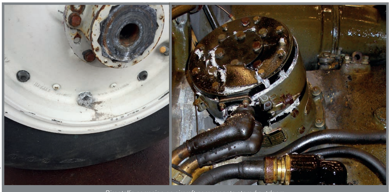
Bimetallic corrosion on aircraft components stored outdoors