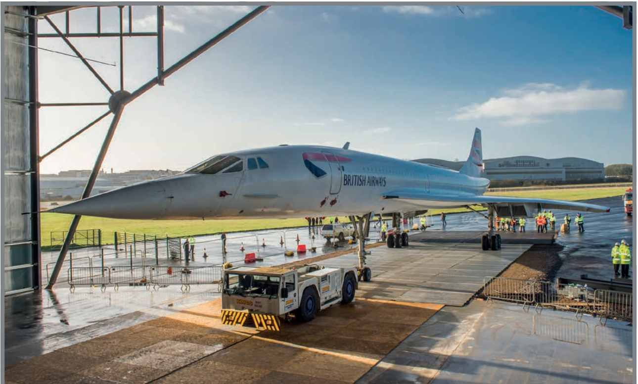
Concorde 'Alpha Foxtrot' being moved into a specially built hangar, at Aerospace Bristol. The hangar was constructed with a movable end wall in order to allow this large aircraft to be placed inside.

Buildings offer the best environmental protection when they are well maintained and operate effectively. Building services – heating, lighting, ventilation, water and power supplies – should be regularly serviced and efficiently used. Buildings themselves may present hazards which impact on the ability to work on or visit the objects they contain. A common issue is the presence of hazardous substances in the fabric of the building or enclosure. Specific restrictions may apply due to legislative requirements, such as the Control of Asbestos Regulations 2012.