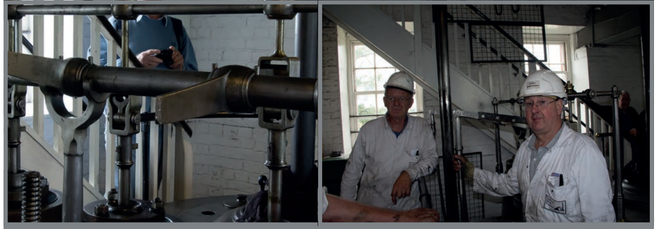
Throttle arm breakage on the Boulton & Watt No.1 engine Crofton Pumping Station, July 2017. This occurred early in the start process and no further damage was caused to the engine. A temporary repair was made to enable operation to be resumed, pending professional conservation advice on permanent repair. This incident was an opportunity to review and improve inspection, maintenance operational and safety procedures, along with conservation and recording practices.

These important controls on operation presuppose two other factors: inspections and training. Regular inspection of the object, whether informally during normal operation or at routine intervals specified in the maintenance plan, is vital, and in some cases, this may require the use of an independent competent inspector. Constant evaluation of the condition of the object will determine both maintenance practice and the course of operation in the future. Training is related to operating practice: those who are authorised to operate and maintain working objects must have suitable training and possess the appropriate certificates.