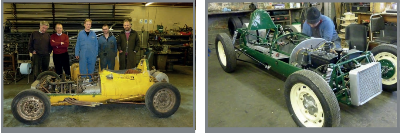
Crosslé factory, car before restoration.