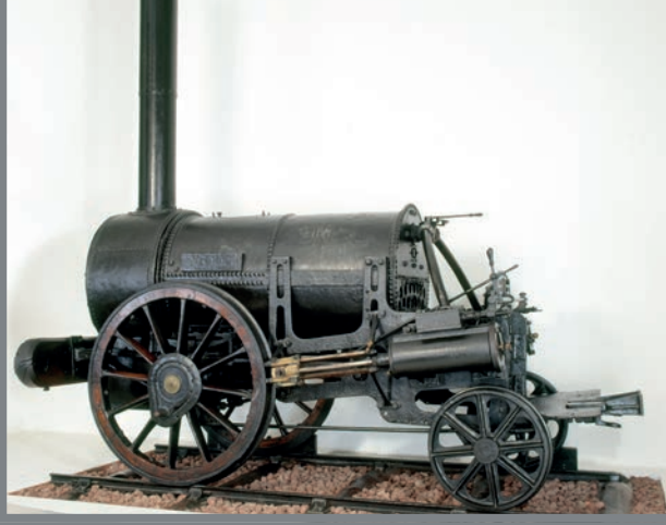
Integrity: Stephenson's Rocket, built in 1829, Science Museum, South Kensington, London. Although preserved as a static display, the associated research of the historic material has resulted in the construction of operable replicas, now based at the National Railway Museum, York.