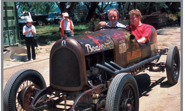
O National Museum