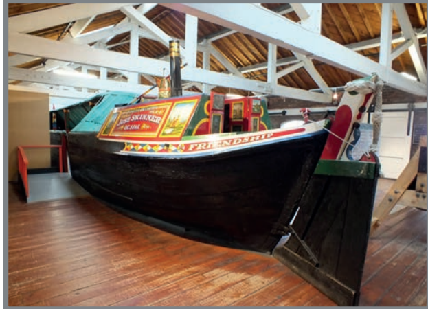
Rarity: Friendship is one of the most famous horse drawn, wooden narrow boats in the country. She is a rare example of an owner-operated horse boat and, for over 50 years, she was the livelihood and home for Joe and Rose Skinner.

Templates and scoring systems to assess significance can be developed to rank similar objects against each other. They should be used with caution as the assessment is still subjective. It is important to maintain a degree of flexibility and introduce a range of points of view in the discussion of significance, otherwise critical elements of importance may be neglected or overlooked.