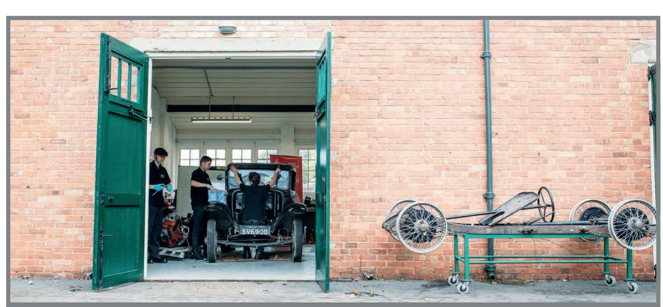
The Federation of British Historic Vehicle Clubs (FBHVC) is actively involved in the development and promotion of the Heritage Engineering Apprenticeship programme. Part of the Government's Trailblazer scheme, it encompasses vehicles, steam, marine and aviation, based on common training modules in the early years and more specialist training in the final year of apprenticeship.