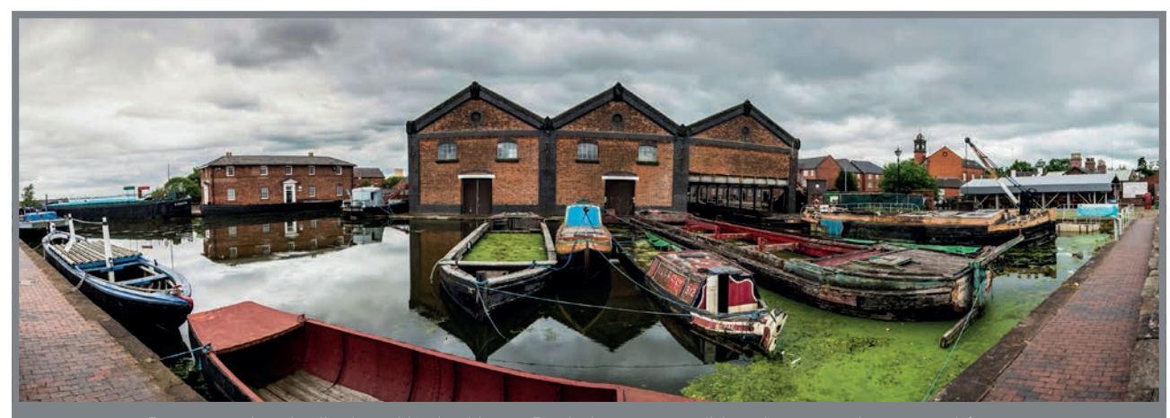
Boats previously displayed in the Upper Basin in poor condition due to environmental factors National Waterways Museum 2017.