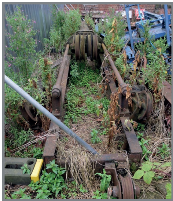
Components of a hydraulic warehouse hoist stored outdoors prior to the storage improvements at the National Waterways Museum in 2017.