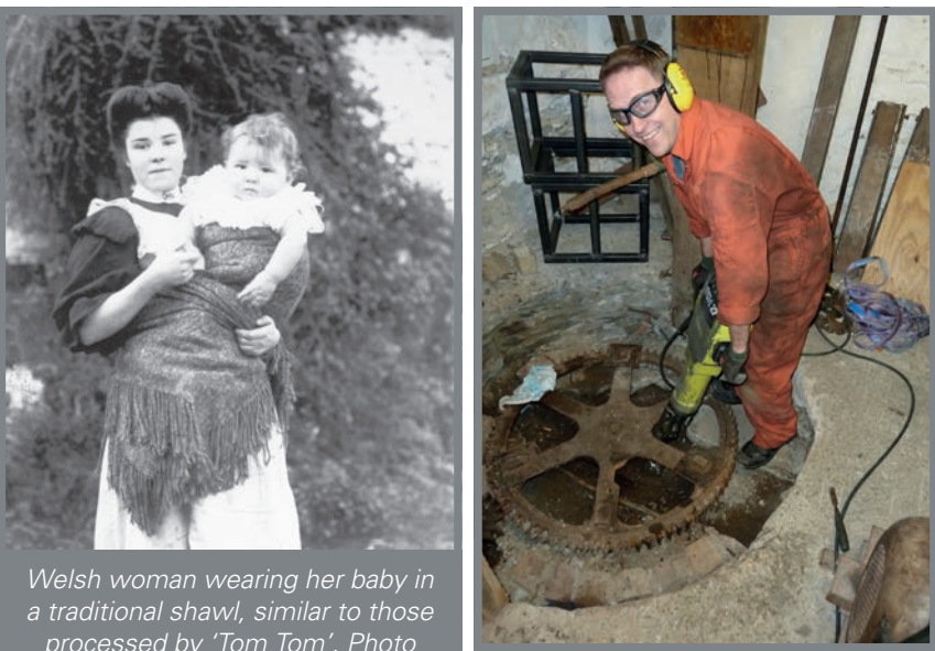
a traditional shawl, similar to those processed by 'Tom Tom'. Photo circa 1905.

The 'Tom Tom' at the National Wool Museum Wales is a working textile finishing machine used to wash, shrink and thicken shawls. Three vertical plungers beat the cloth inside a slowly rotating barrel. This process gives the shawls a very soft feel particularly good for the nursing shawls used to carry babies in Welsh fashion.