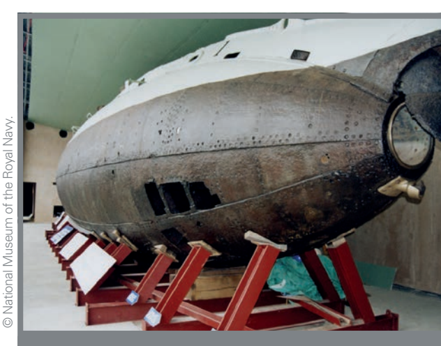
Representativeness: Holland I was the first ever submarine commissioned by the Royal Navy. Sunk accidentally in 1913, it was rediscovered in 1981. In 1993 the Museum of Royal Navy undertook an innovative method of conservation, by building a bespoke tank and submerging the submarine in a solution of sodium carbonate for 5 years, to wash the salts out of the fabric of the hull.