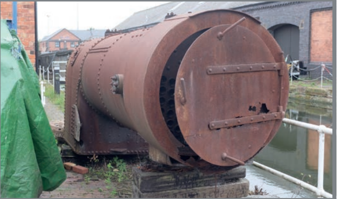
Outdoor storage of the boiler from the grab dredger Perseverance, prior to the storage improvements at the Museum.