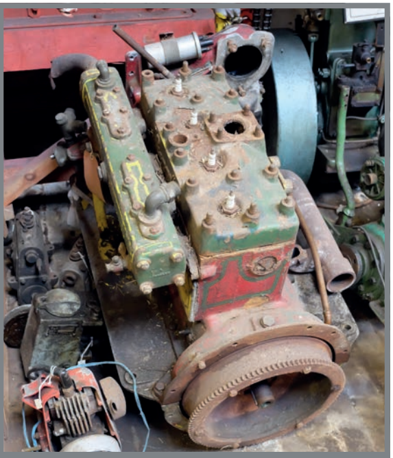
An Engine stored on damp floor prior to the storage improvements at the National Waterways Museum in 2017.