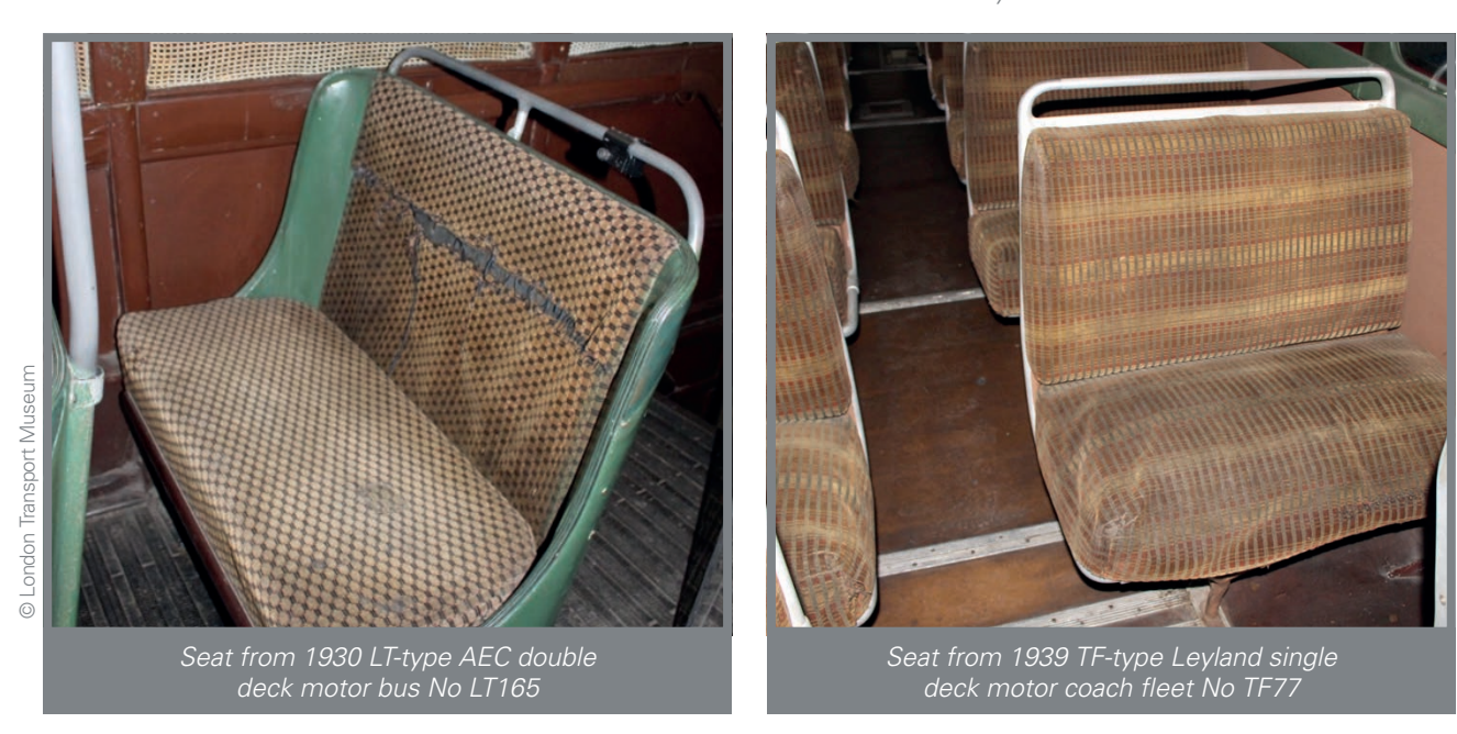
Guidelines for the Care of Larger and Working Historic Objects 2018 39

Historic seats from road vehicles in the London Transport Museum. Those sears are made with foam rubber padding with moquette covering. The foam has hardened over time to the extent that the seats can no longer be used, while the moquette in some cases, is very delicate. The Museum is exploring options that will allow preserving the historic material of the seats while allowing the occasional use of the vehicles that are still in roadworthy condition.