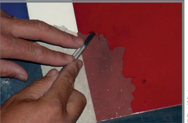
The 1960's paintwork being painstakingly removed.