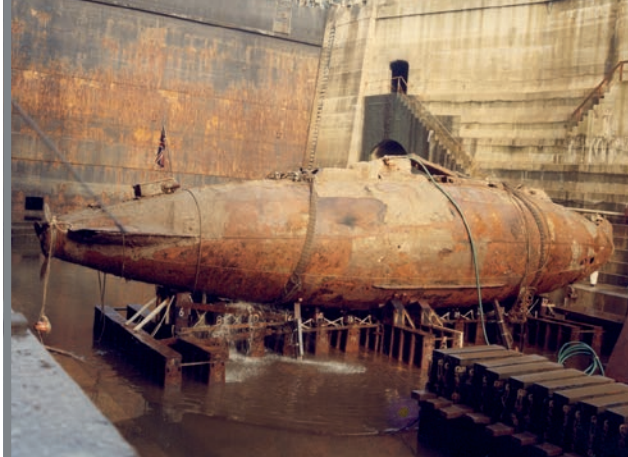
after being sunk for 69 years.

Remedial conservation treatments can be applied to objects that still maintain their ability to operate, but which are judged too significant, rare or fragile to do so. In this case inhibition techniques may be applied as a preventive measure to protect moving parts from seizing and internal corrosion. This is explored further in Section 4.