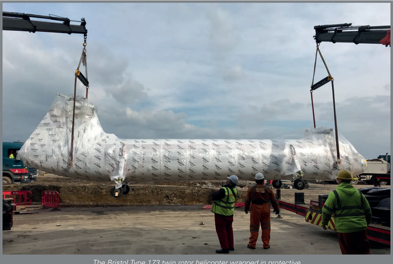
The Bristol Type 173 twin rotor helicopter wrapped in protective material and lifted by two cranes, arrives at Aerospace Bristol.

There are many types of potential hazards, including unsafe or unstable mountings and supports, dangerous substances (such as asbestos, heavy metals, polychlorinated biphenyls (PCBs), solvents and chemicals, lead-based paints, radioactive substances including luminous paint), and high voltages in electrical or electronic equipment.