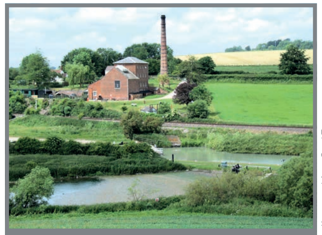
Rarity: Crofton Pumping Station. The engine house contains an operational Boulton & Watt steam engine largely dating back to 1812 that is the oldest beam engine in the world on its original site and still capable of doing the job for which it was installed, raising water to the summit level of the Kennet and Avon Canal.