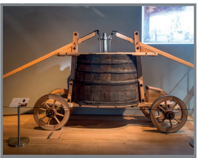
Authenticity: This reconstruction of a 17 Century Fire Engine, contains a historic central barrel and iron pumping mechanism. Based on an early photograph and an original drawing, the Museum of London was able to rebuild the engine to show how it looked and how efficiently it worked.