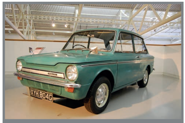
Originality: This Hillman Imp was donated to the British Motor Museum collection. The car is in almost original condition, the owner maintaining and servicing the car, but carrying out no modifications or alterations. When acquired, the decision was made to display the vehicle in this condition, with only minor cleaning required and not to carry out any major restoration or conservation