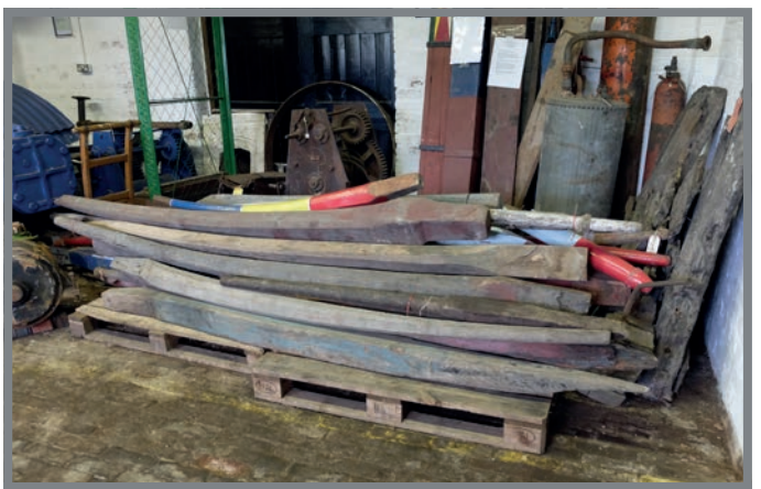
Components from historic vessels stored clear of the floor in the stores of the National Waterways Museum.